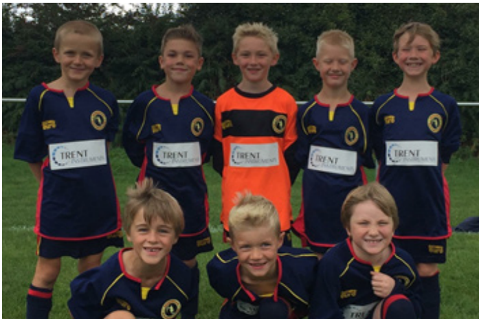
Sherwood Reds under 8s